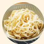
长寿面 Longevity noodle