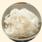
河粉 Rice Noodle