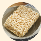
风干面 Air dried noodle