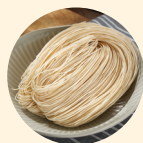
面线 Mee Sua